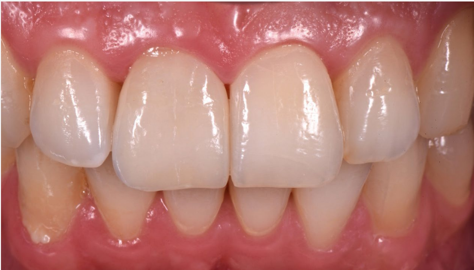
Veneer on right central incisor

Zahntechnik Düsseldorf, Rebbe. Thielen. Joit. GmbH, Düsseldorf, Germany